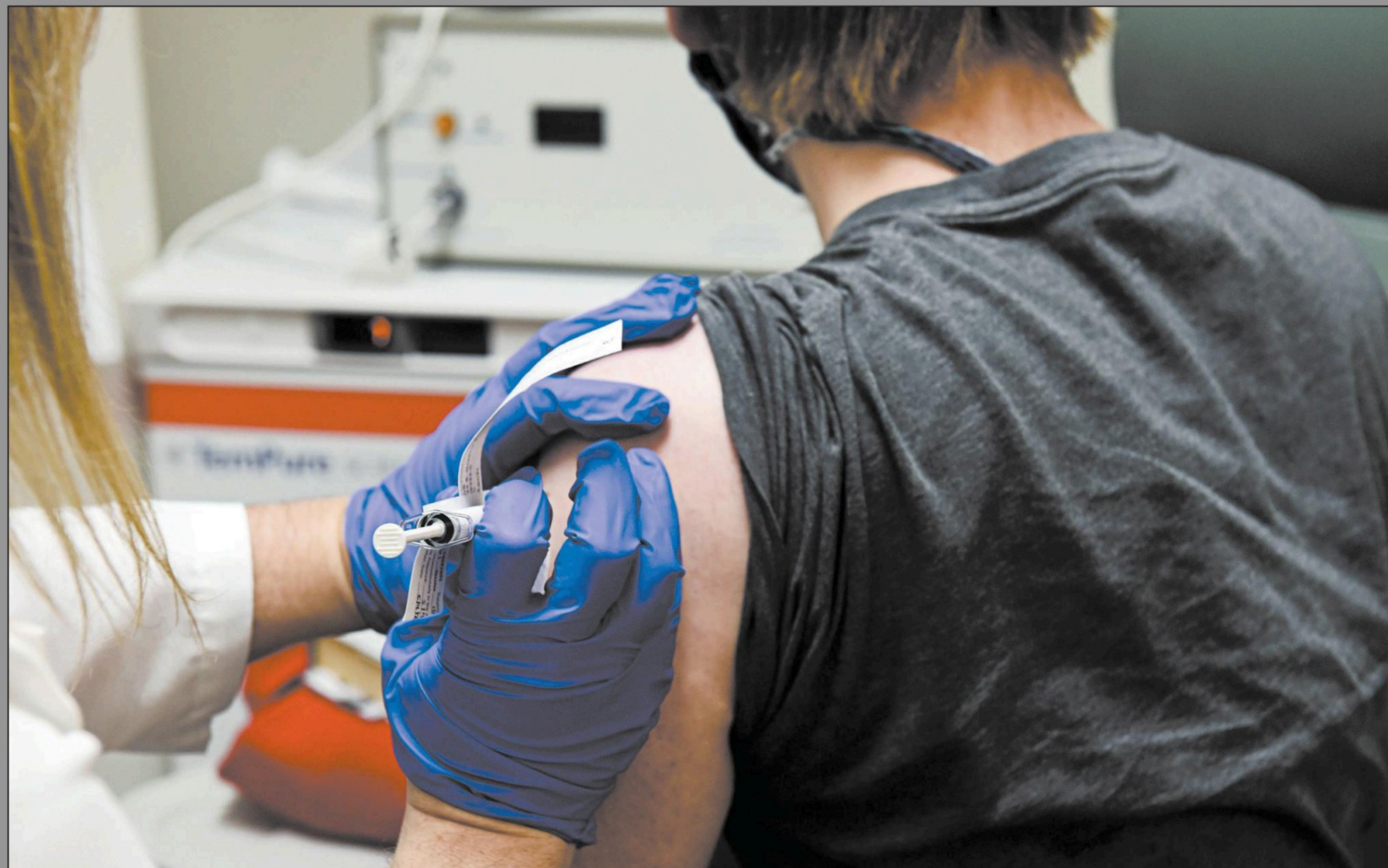
UNIVERSITY OF MARYLAND SCHOOL OF MEDICINE

Dr. Francis Collins, who directs the National Institutes of Health, insists safety is the top priority. The NIH is creating a master plan for testing the leading COVID-19 vaccine candi-